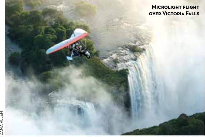
MICROLIGHT FLIGHT OVER VICTORIA FALLS