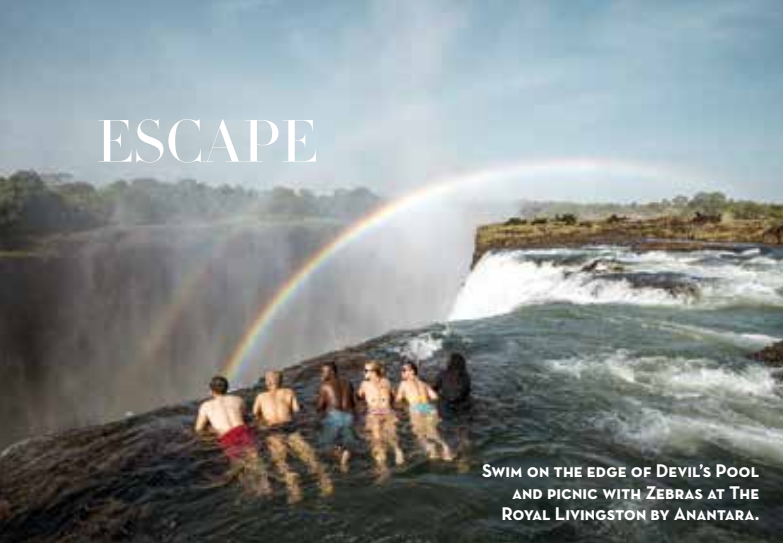
SWIM ON THE EDGE OF DEVIL'S POOL AND PICNIC WITH ZEBRAS AT THE ROYAL LIVINGSTON BY ANANTARA.