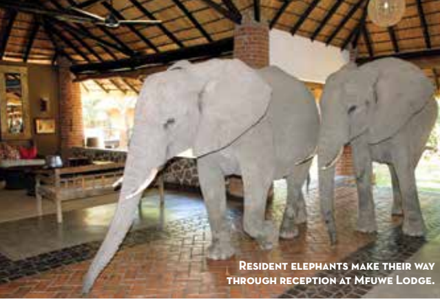
RESIDENT ELEPHANTS MAKE THEIR WAY THROUGH RECEPTION AT MFUWE LODGE.

While in Zambia, keep the adrenaline pumping with thrill-seeking excursions across Victoria Falls. First, unwind from the bush at The Royal Livingstone Victoria Falls Zambia Hotel by Anantara. The colonial-inspired property shoulders the island-studded Zambezi River and takes full advantage of the sweeping views by way of room design—each has a river-facing veranda—