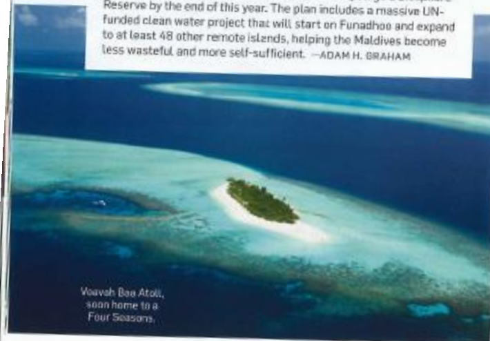
Voavah Baa Atoll, soon home to a Four Seasons.