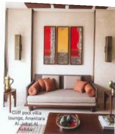
Cliff pool villa lounge, Anantara Al Jabal Al Akhdar.