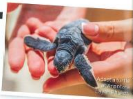
Adopt a turtle at Anantara Layan Phuket.